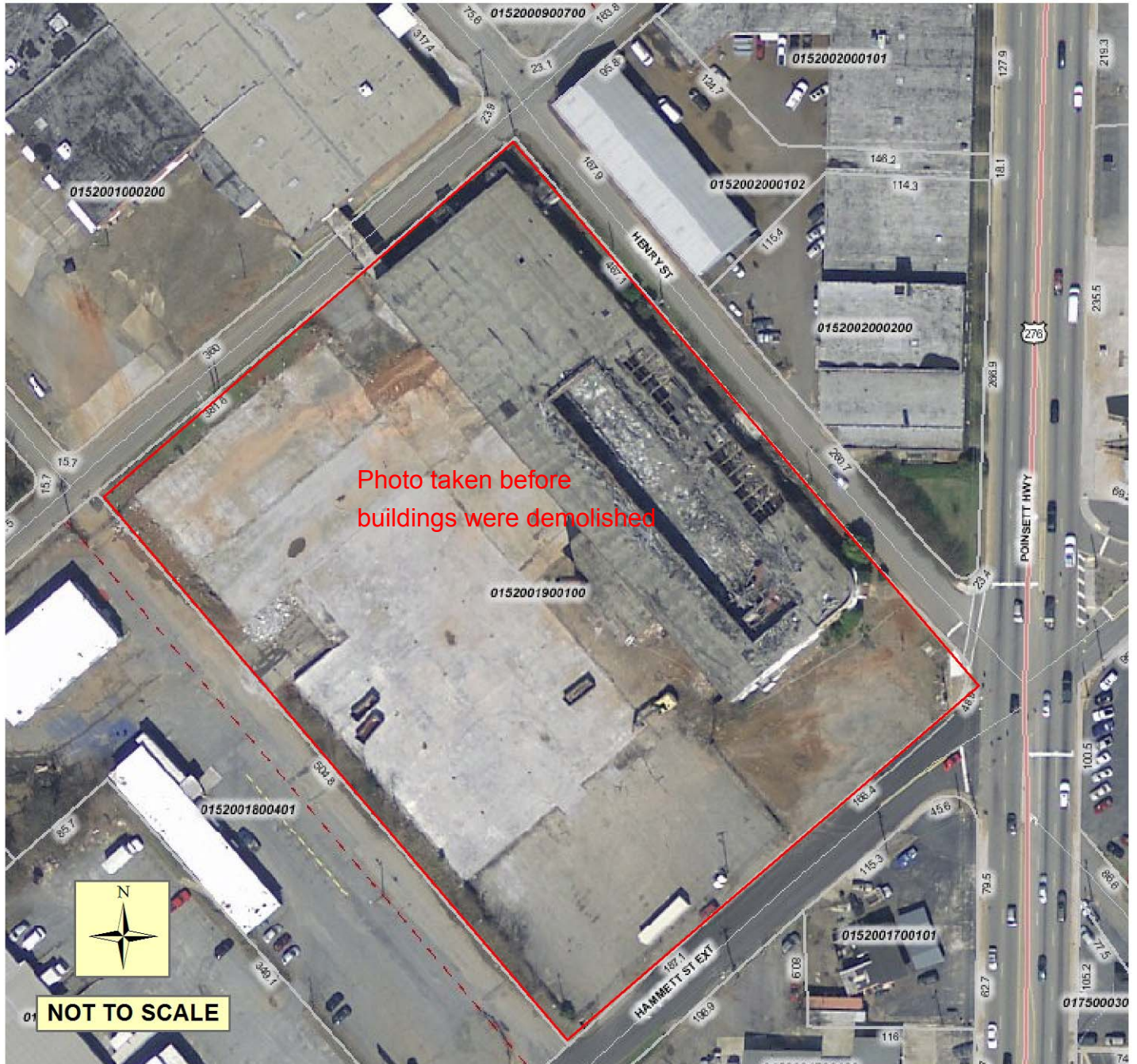
Basemap: Greenville County