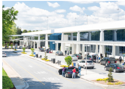
Donaldson Field at SC TAC sc-tac.com

As the fourth busiest container port in the nation, the Port of Charleston handles more than $3 million in cargo every hour. The Port offers the deepest channels in the region - capable of accommodating 8,000 TEU ships - and provides convenient access to global markets.