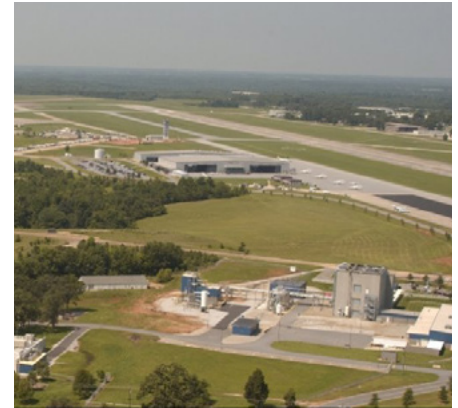
Donaldson Field at SC-TAC

GSP offers room for new development opportunities in a secure and modern environment – and with a Business Development Team that is available as a main contact point, GSP offers guidance on FAA procedures, US CBP requirements, airport service providers and customer relations. Existing air cargo facilities include a 25-dock and 38,600 SF joint-use facility, along with an Air Cargo Center and Foreign Trade Zone. Federal inspection services are available 24/7 and can clear shipments through customs in less than two hours.