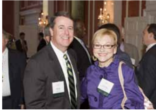
A full house gathering of guests enjoyed the GADC 2011 annual meeting