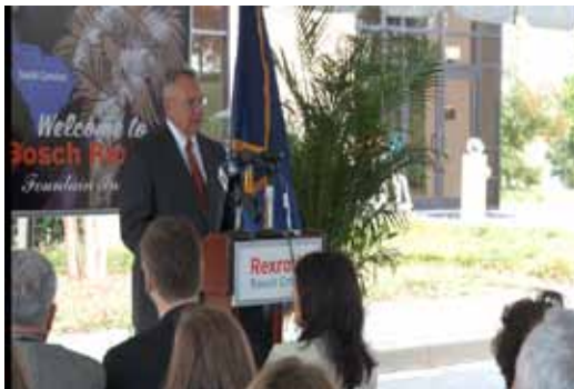
Greenville County Council Chairman Butch Kirven addresses guests at the Fall 2011 Bosch Rexroth expansion announcement