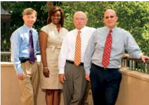
GADC project management team gather in a rare quiet moment