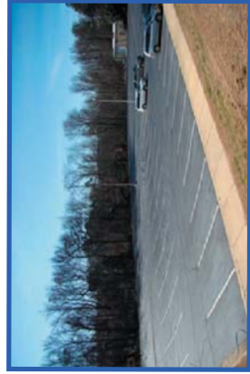
ABUNDANT ON-SITE PARKING